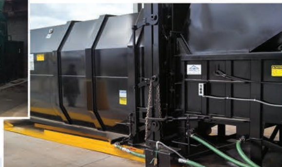
Custom "Air Feed" Compactor Installation