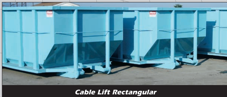
Cable Lift Rectangular