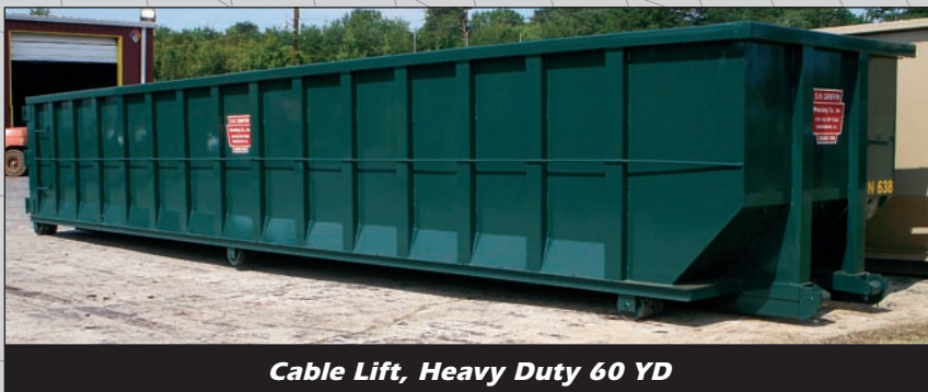
Cable Lift, Heavy Duty 60 YD