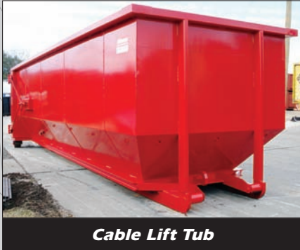
Cable Lift Tub