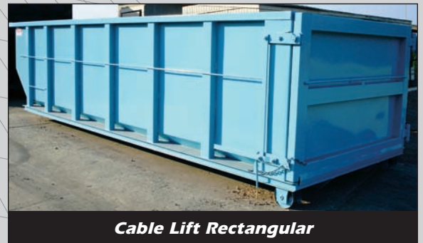
Cable Lift Rectangular