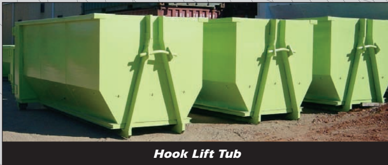
Hook Lift Tub