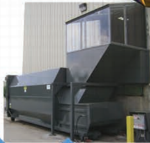
Full Enclosure SC Compactor Installation