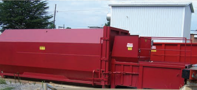
Full Enclosure Stationary Compactor Installation