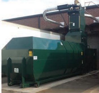
Custom "Air Feed" Compactor Installation