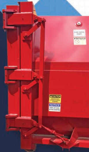
“LeakTight” Sealed Gate

by Pinnacle technicians. 15HP motors & 12 GPM pumps standard. reliable and easy to troubleshoot. coupling connection between industry standards. ns provide max compaction. gn on SC’s yield excellent t. ns excel in customer service and training.