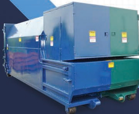
Special Dual Purpose Self-Contained Compactor