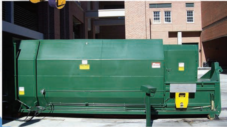
Self-contained Compactor Installation with Doghouse Hopper and Cart Tipper

by Pinnacle technicians. 15HP motors & 12 GPM pumps standard. reliable and easy to troubleshoot. coupling connection between industry standards. ns provide max compaction. gn on SC’s yield excellent t. ns excel in customer service and training.