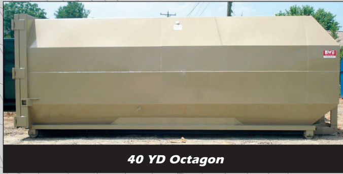
40 YD Octagon