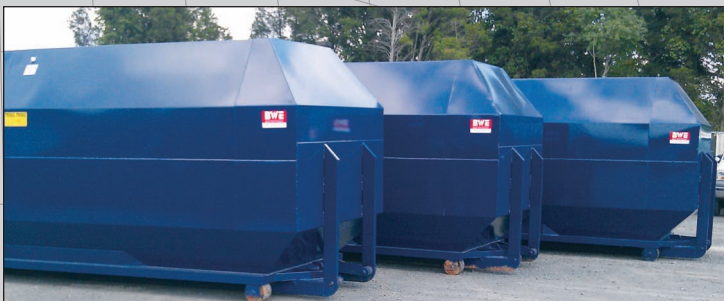
Receivers Ready For Deployment