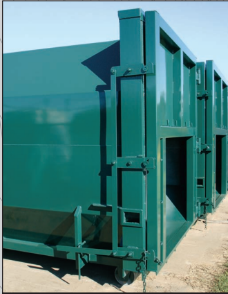
Receiver Door Latches