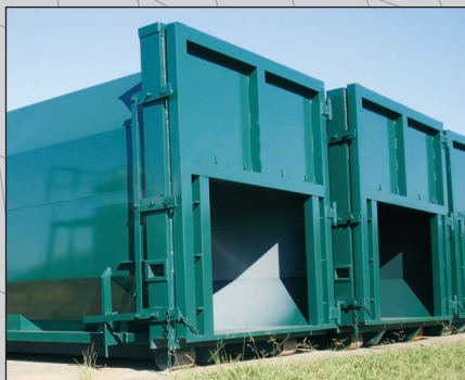
40 YD Receiver Inventory