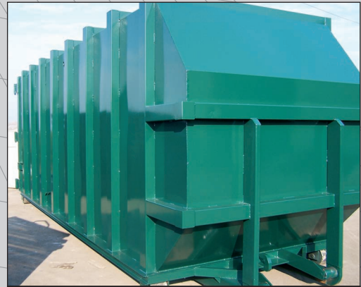
42 YD HD Rectangle