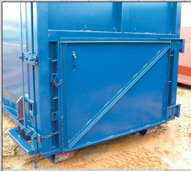
Receiver Travel Door