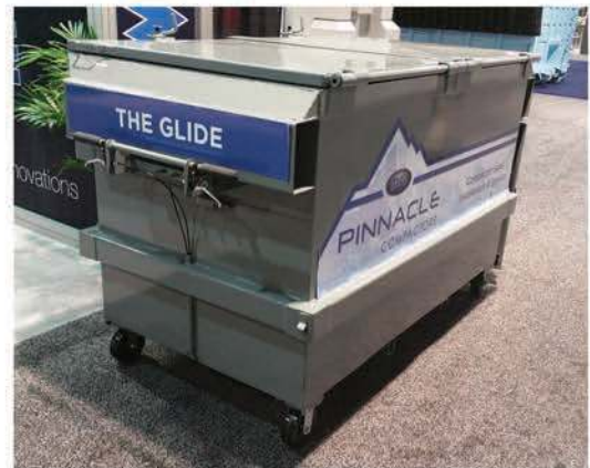
Compactors receivers with The Glide Wheel System are safer and easier to maneuver