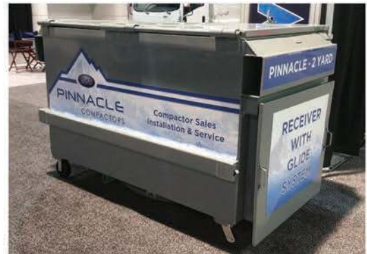
The built in braking system prevents runaway containers. The wheels also lock down for hauler pickup.